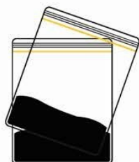
PLASTIC ZIP TOP BAG NO LARGER THAN 1 GALLON