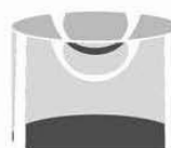
TINTED/ TEXTURED BAG