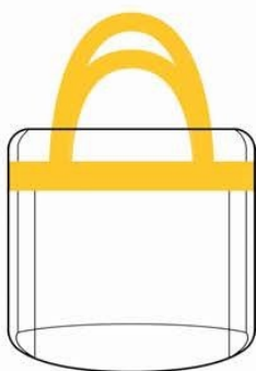
CLEAR TOTE PLASTIC, VINYL, OR PVC AND NO LARGER THAN 12" X 6" X 12"