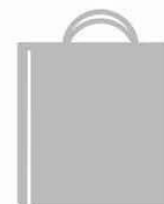
REUSABLE GROCERY TOTE