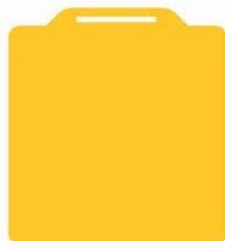
SEAT CUSHION NO ARMS OR POCKETS NO LARGER THAN 16"

ALL ITEMS ARE SUBJECT TO SEARCH ALL PROHIBITED ITEMS WILL BE DENIED AT THE GATES AND ITEMS MAY NOT BE STORED AT OR NEAR THE ROCK. SOUTHERN MISS ATHLETICS IS NOT RESPONSIBLE FOR PROPERTY DAMAGE OR LOST/STOLEN ARTICLES.